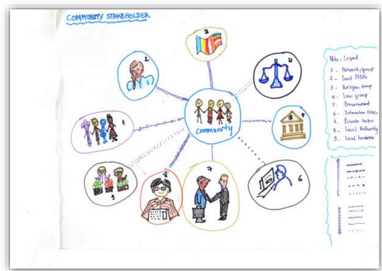
Community Stakeholders Mapping

4.2 Stakeholders Discussion: After the map has been created, community members should meet with the contacts that can help provide the services the community needs. The community can discuss a strategy for attending these meetings and presenting their proposals to each stakeholder. At these meetings, it will be important to discuss the potential collaboration between the community and the proposed partner.