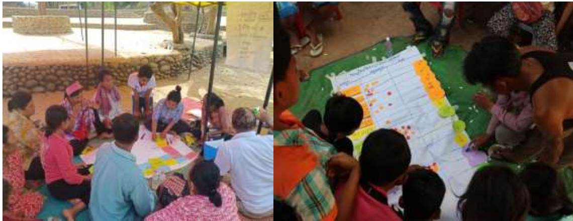
Community Strategic Meeting / Workshop

Note: Strategic integration should be a series of discussions. Some information may only become available after future interactions between the community and company. Partners should remain involved, and strategic integration should remain flexible and updated to allow for this involvement.