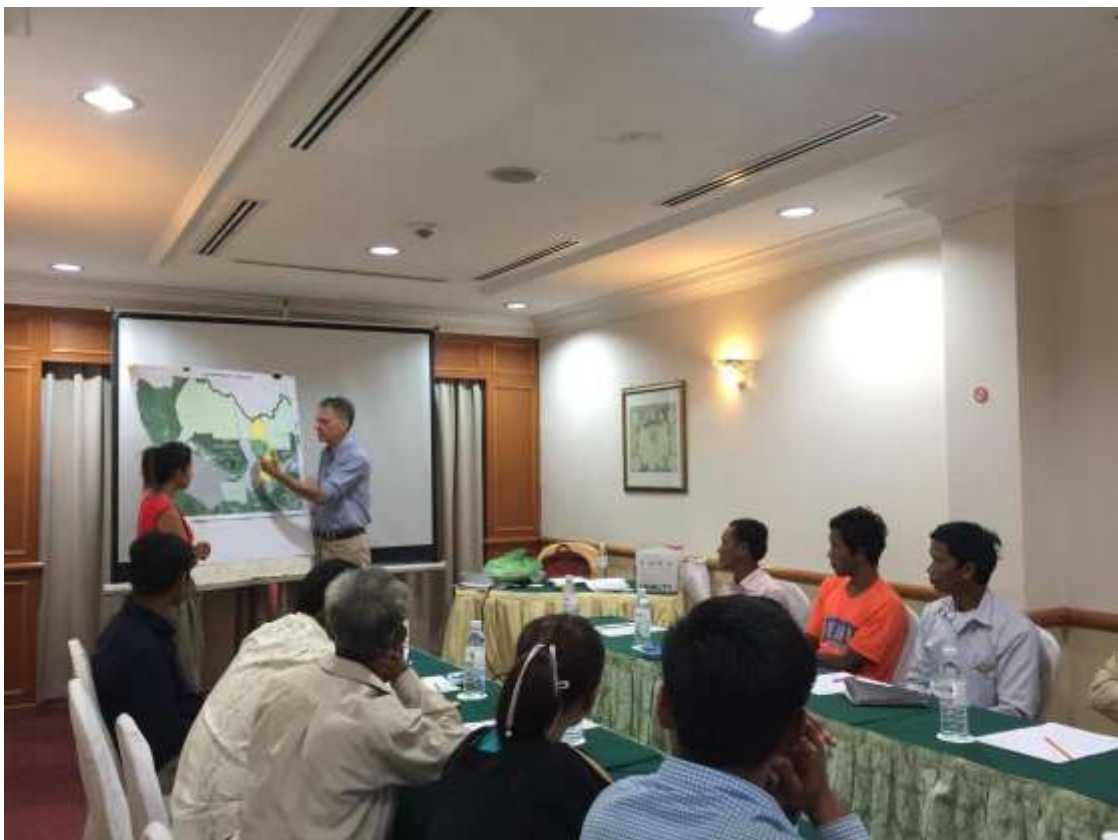
Designing Roles and Responsibilities between Community and Partners