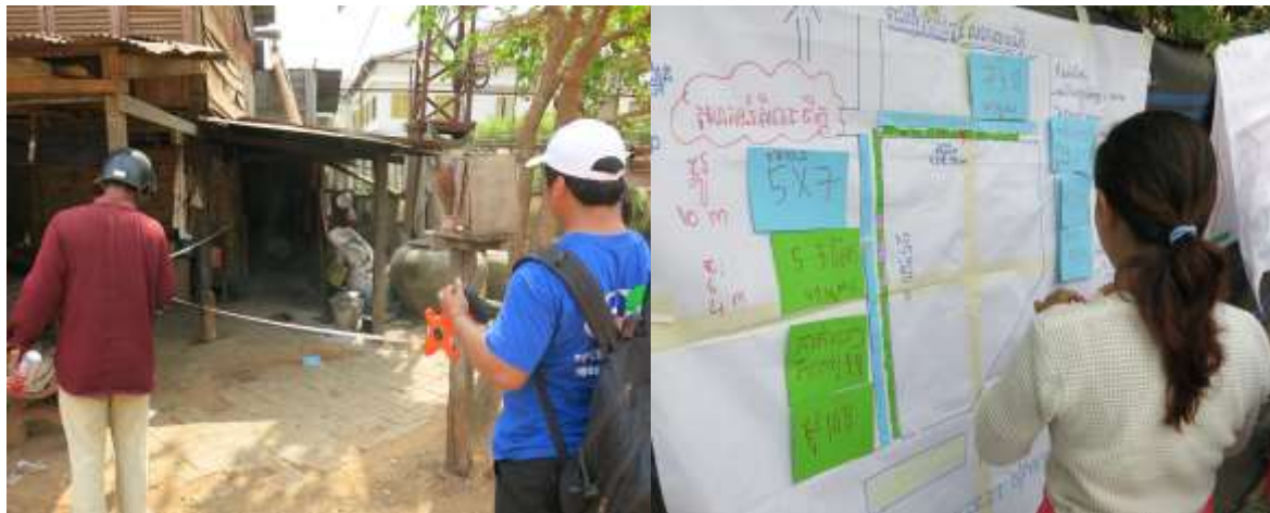
Land Plot Measurement and Housing Design Layout