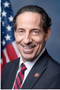
Jamie Raskin Congressman, Maryland's 8th Congressional District in the U.S. House of Representatives