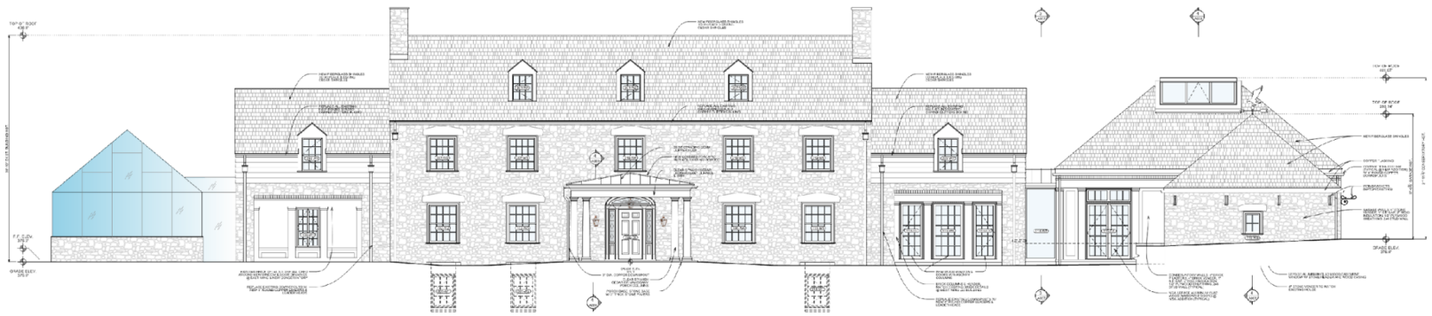
2 PROPOSED SOUTH ELEVATION SCALE: 3/16" = 1'-0" NEW CONSTRUCTION